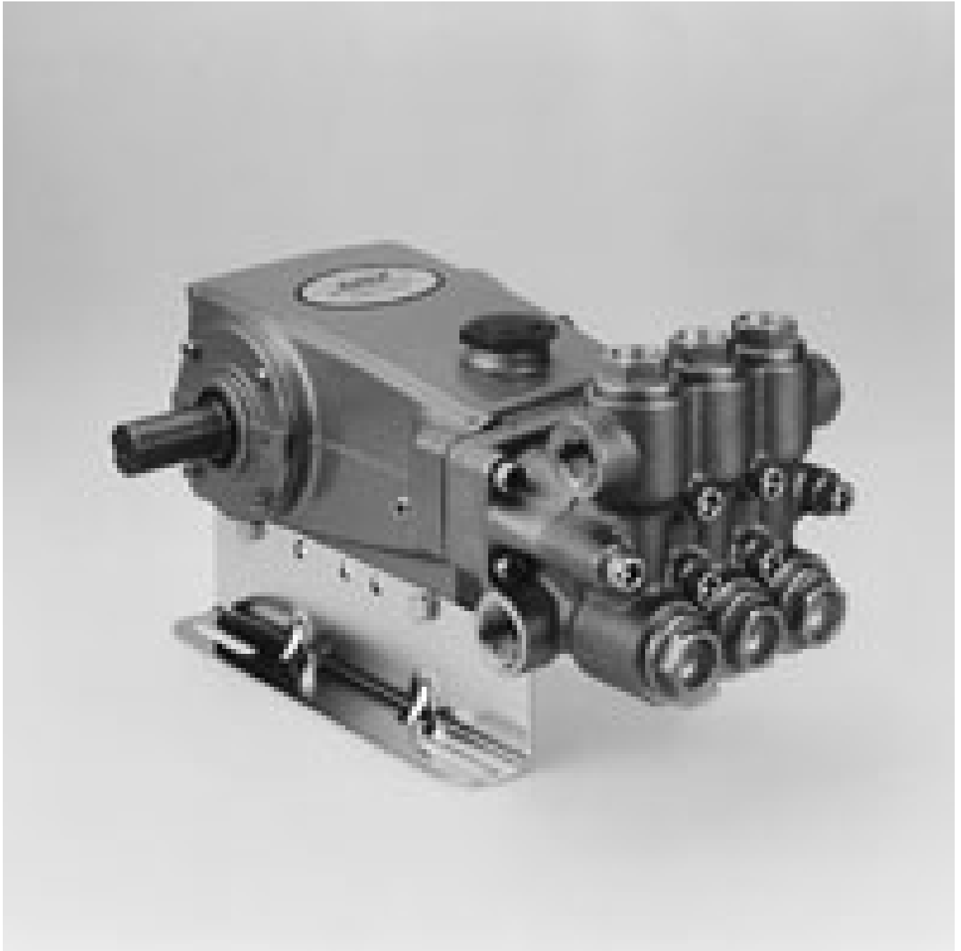
1531 15 FRAME PLUNGER PUMP