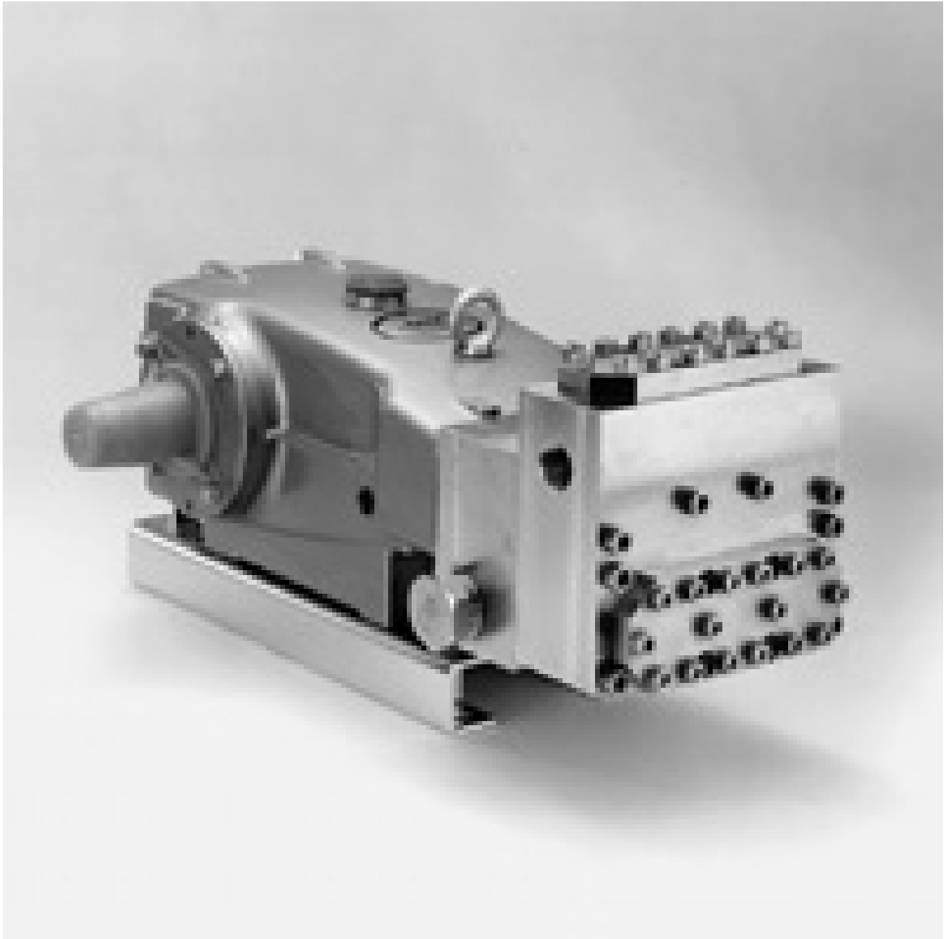
3821K38 FRAME BLOCK-STYLE PLUNGER PUMP