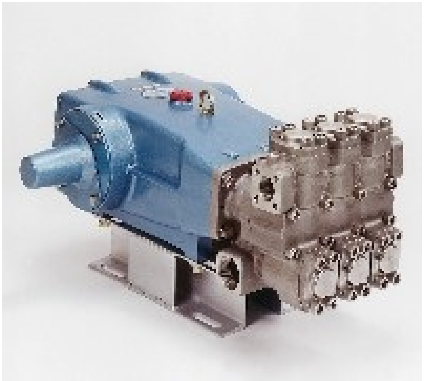
677160 FRAME PLUNGER PUMP