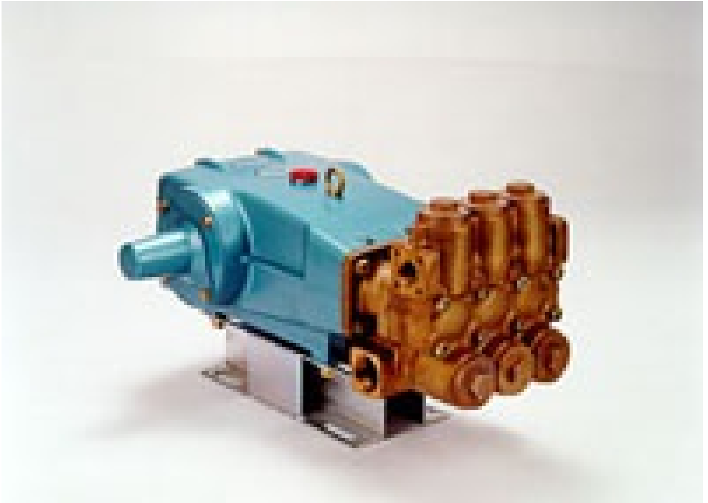
676760 FRAME PLUNGER PUMP