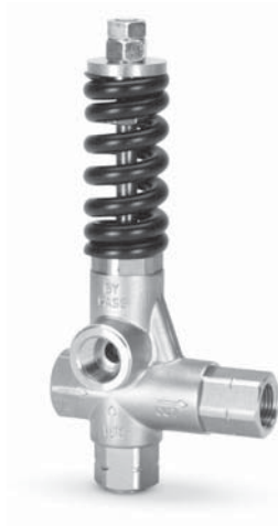
Model 7536 Shown