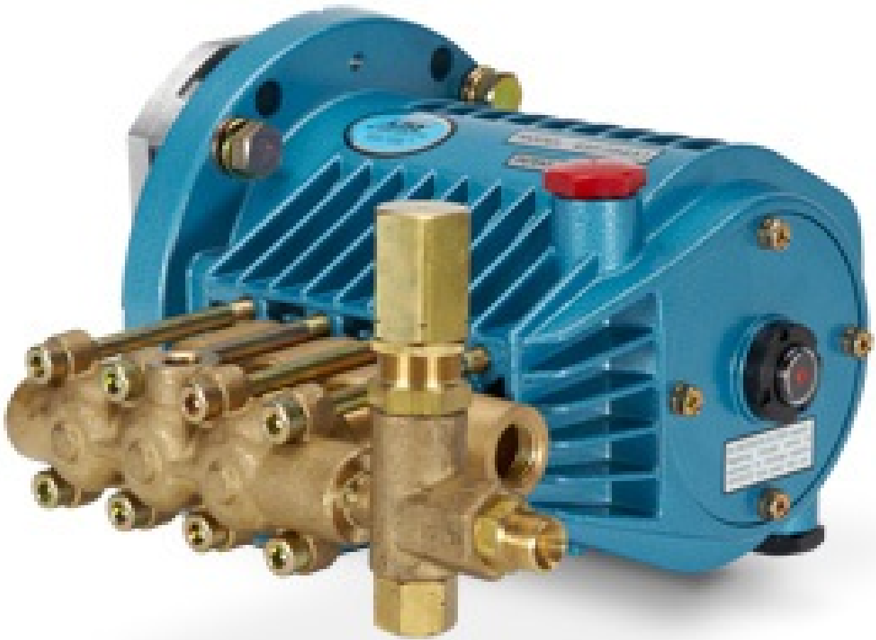
4SF35GS14SF DIRECT DRIVE PLUNGER PUMPS