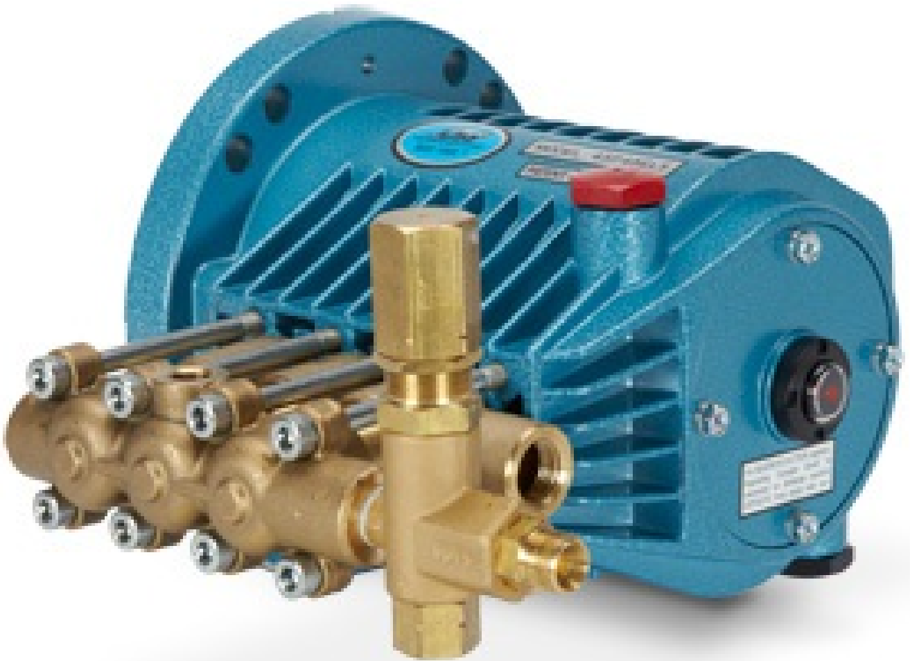
4SF32ELS 4SF DIRECT DRIVE PLUNGER PUMPS