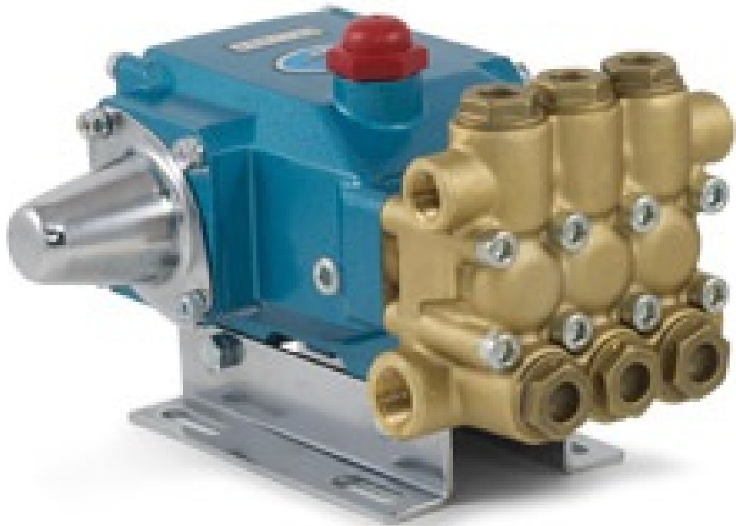
3CP11303CP PLUNGER PUMP