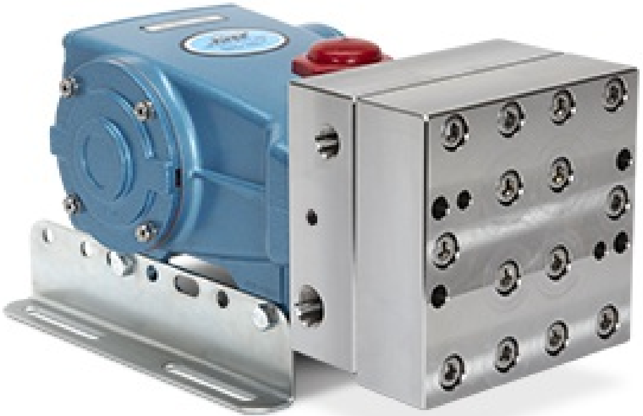
781K8 FRAME BLOCK-STYLE PLUNGER PUMP