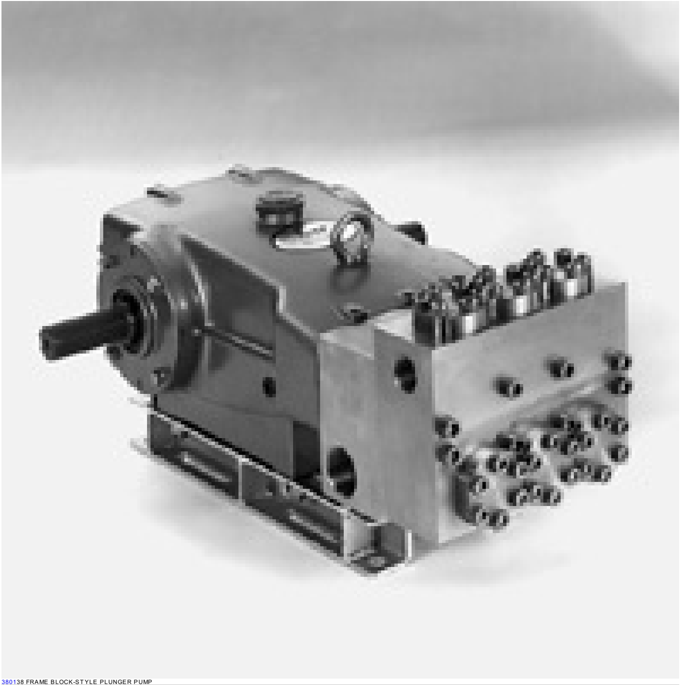
380138 FRAME BLOCK-STYLE PLUNGER PUMP 781ALT8 FRAME BLOCK-STYLE PLUNGER PUMP