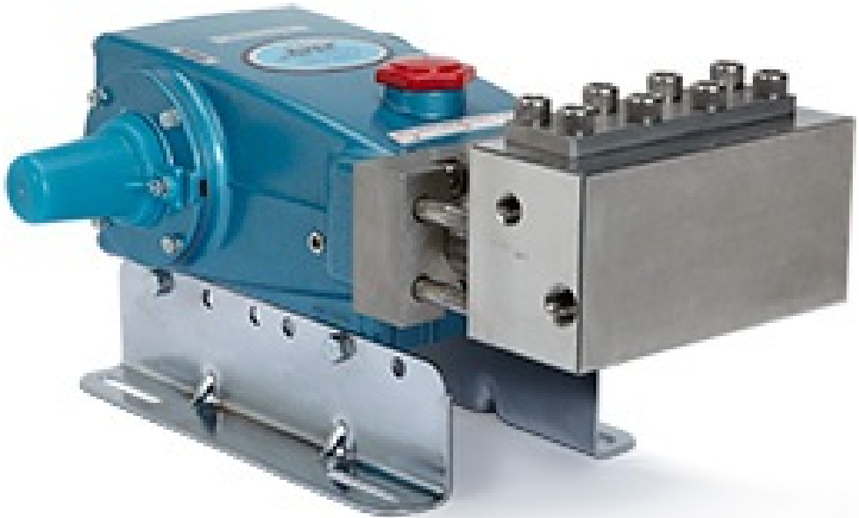
157015 FRAME PLUNGER PUMP