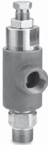
Model 890710 Shown

Standard Models: 1" 890710, 890711, 890712, 890714 2" 890703, 890713, 890715, 890721