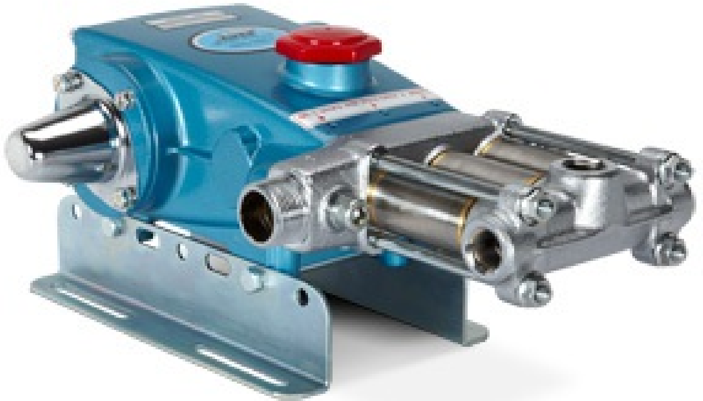
3005 FRAME PISTON PUMP 1010 FRAME PISTON PUMP