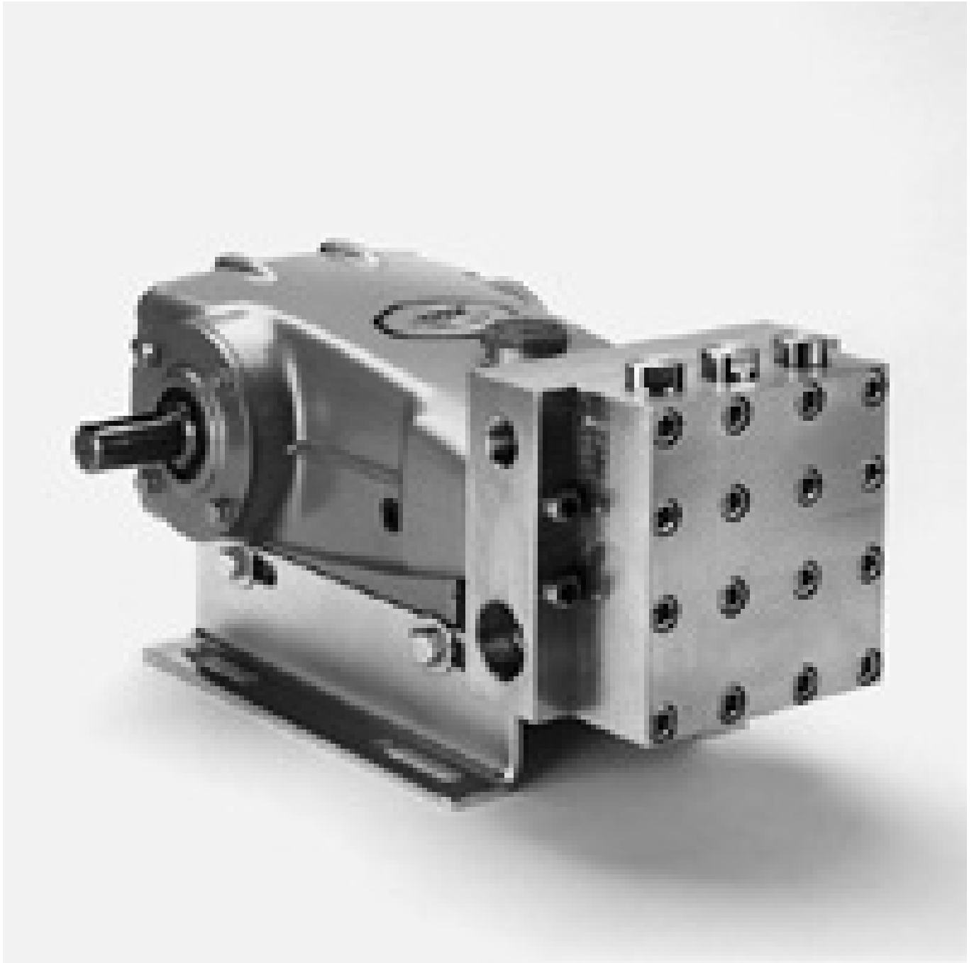
2831K28 FRAME BLOCK-STYLE PLUNGER PUMP