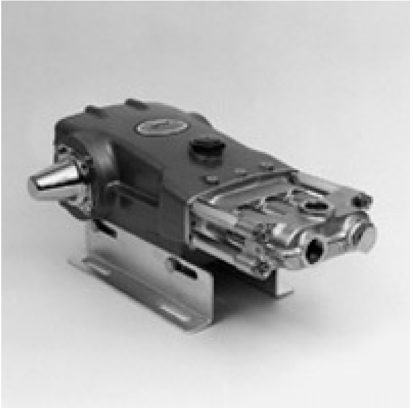
252125 FRAME PISTON PUMP