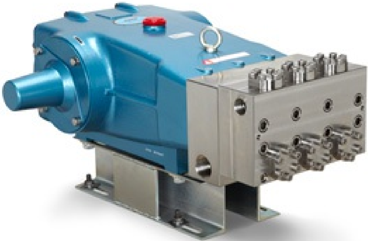
6821K68 FRAME BLOCK-STYLE PLUNGER PUMP