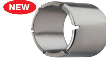
Figure 206 Barbed 300/400 PSI CWP Specially Designed Lip Type Elastomer Seal Protects Metal to Metal Sealing Surface and Reduces Line Flow Turbulence