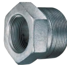
Female Spud with Copper Seal (Female NPT x Male NPS)