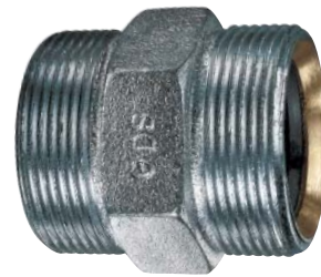
Double Spud with Copper Seal (Male NPS x Male NPS)