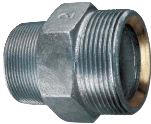
Male Spud with Copper Seal (Male NPT x Male NPS)