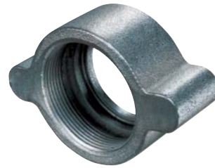
Wing Nut (NPS Threads)