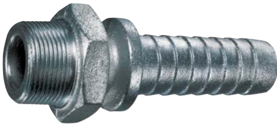
Threaded Male Hose Shank (Male NPT x Hose Shank)