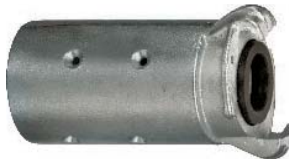
Plated Iron Two Lug Hose Coupling