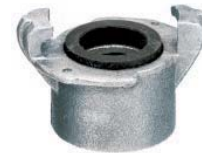
Aluminum Two Lug Female Threaded Coupling (NPT Threads)