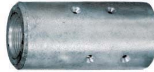
Aluminum Nozzle Holder (NPS Threads)