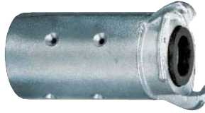
Aluminum Two Lug Hose Coupling