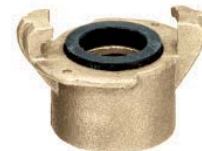
Brass Two Lug Female Threaded Coupling (NPT Threads)