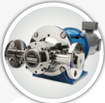
LIQUIFLO GEAR PUMP