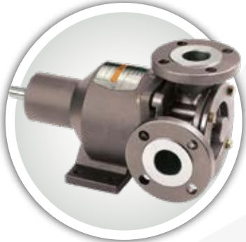
BLACKMER INTERNAL GEAR PUMP