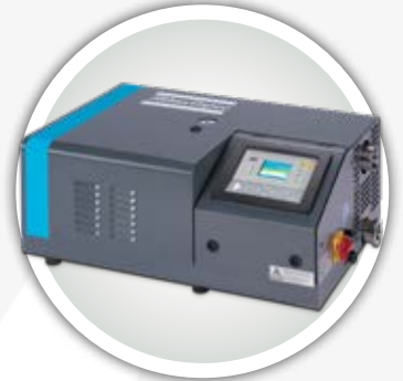
ATLAS COPCO DHS VSD+