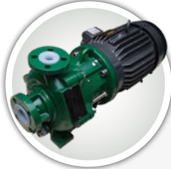
ANSIMAG SEALLESS MAGNETIC DRIVE PUMP