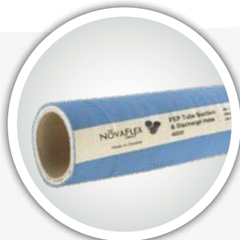
NOVAFLEX 4600CF FEP CHEMICAL TRANSFER