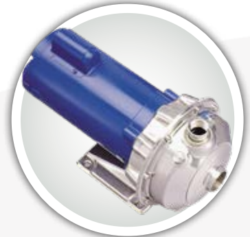
GOULDS NPE SERIES PUMP