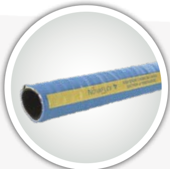
NOVAFLEX 4200BE / 4201BE EPDM CHEMICAL SUCTION