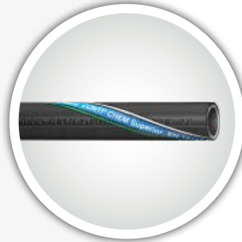
CONTINENTAL CONTI CHEM SUPERIOR