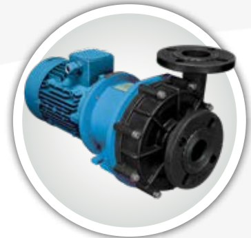
T-MAG MAG DRIVE PUMP