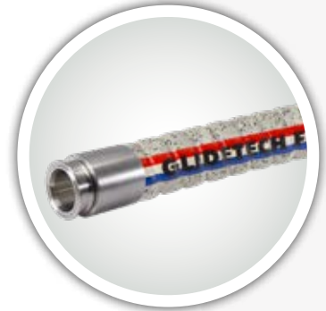
GLIDETECH PTFE BIOTECH CHEM