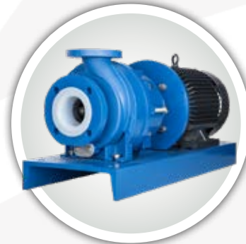
FINISH THOMPSON ULTRACHEM MAG DRIVE PUMP