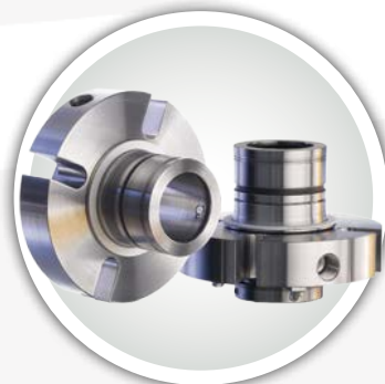
FLEX-A-SEAL MECHANICAL SEAL