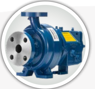
GRISWOLD 811 ANSI PUMP