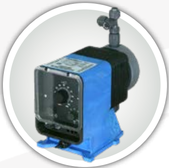
PULSATRON METERING PUMP