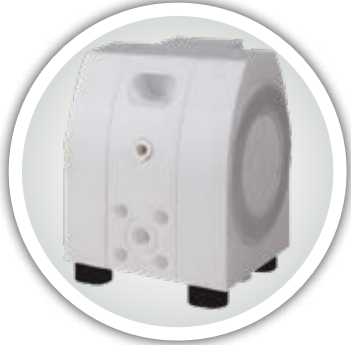
ALMATEC E-SERIES AODD PUMP