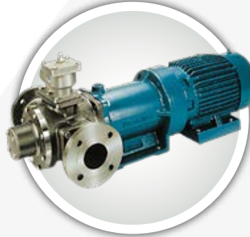
BLACKMER SLIDING VANE PUMP