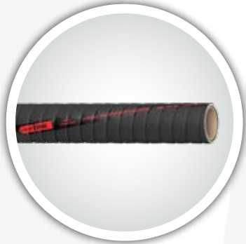
CONTINENTAL CHEM ONE