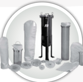
FILTER TECHNOLOGY BAG FILTER HOUSINGS