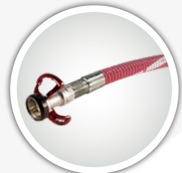
UNI-CHEM / UNI-FLON CHEMICAL COMPOSITE HOSE