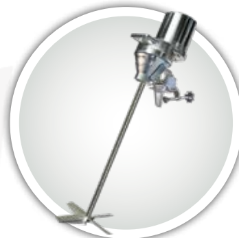
SHARPE PORTABLE MIXER