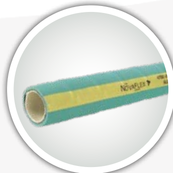
NOVAFLEX 4700CU UHMW CHEMICAL S & D