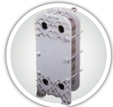
STANDARD XCHANGE HEAT EXCHANGER