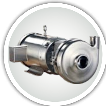
AMPCO AC/AC+ CENTRIFUGAL PUMPS