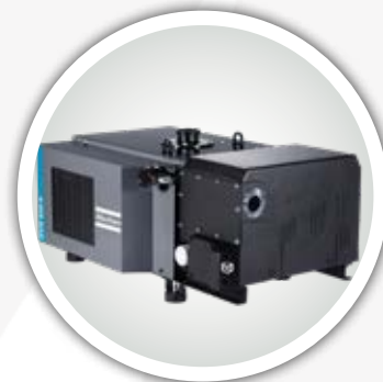
ATLAS COPCO GVS A SERIES VACUUM PUMPS