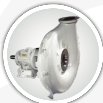
CORNELL HYDRO-TRANSPORT PUMPS