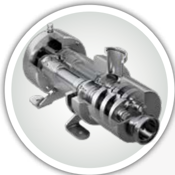
AMPCO TWIN SCREW PUMPS