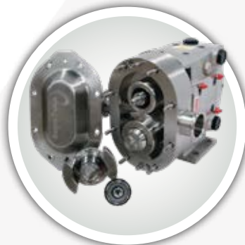
AMPCO ZP CIRCUMFERENTIAL PISTON PUMPS