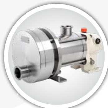
MOUVEX ECCENTRIC DISC PUMPS