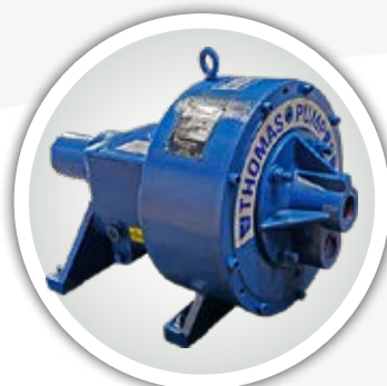
THOMAS HIGH PRESSURE PUMPS