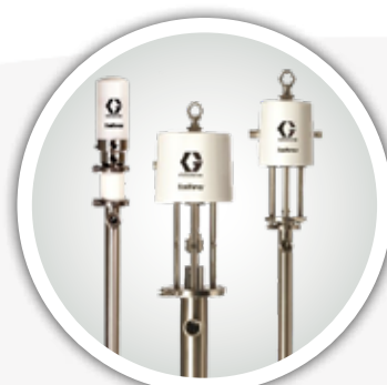
GRACO SANIFORCE PISTON PUMPS