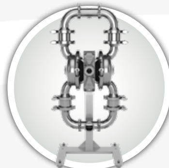
WILDEN DIAPHRAGM PUMPS