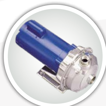
GOULDS CENTRIFUGAL PUMPS