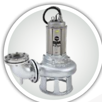
BJM SUBMERSIBLE PUMPS