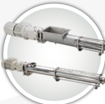
ROTO PROGRESSIVE CAVITY PUMPS